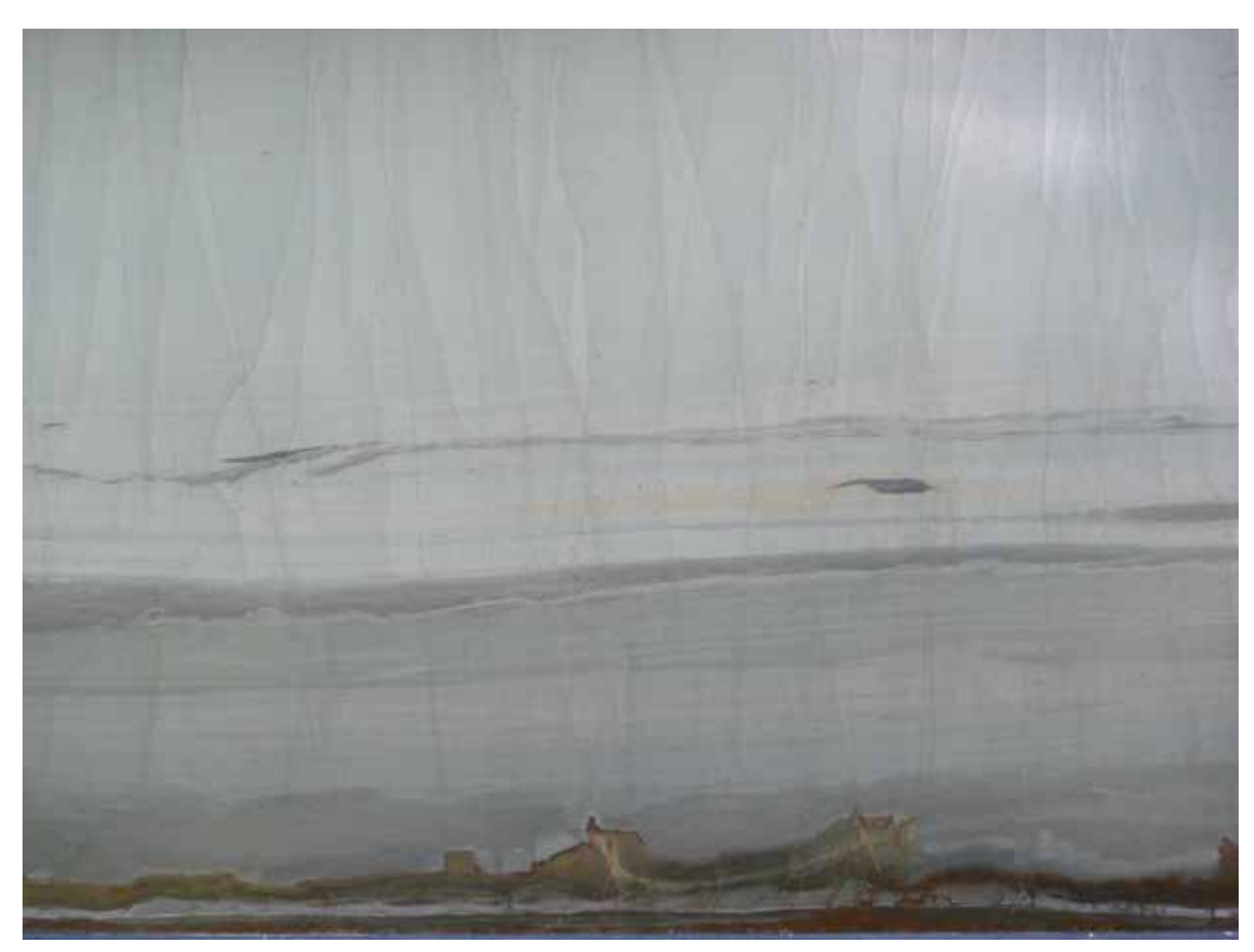
Fig. 4. Dream stone "landscape."