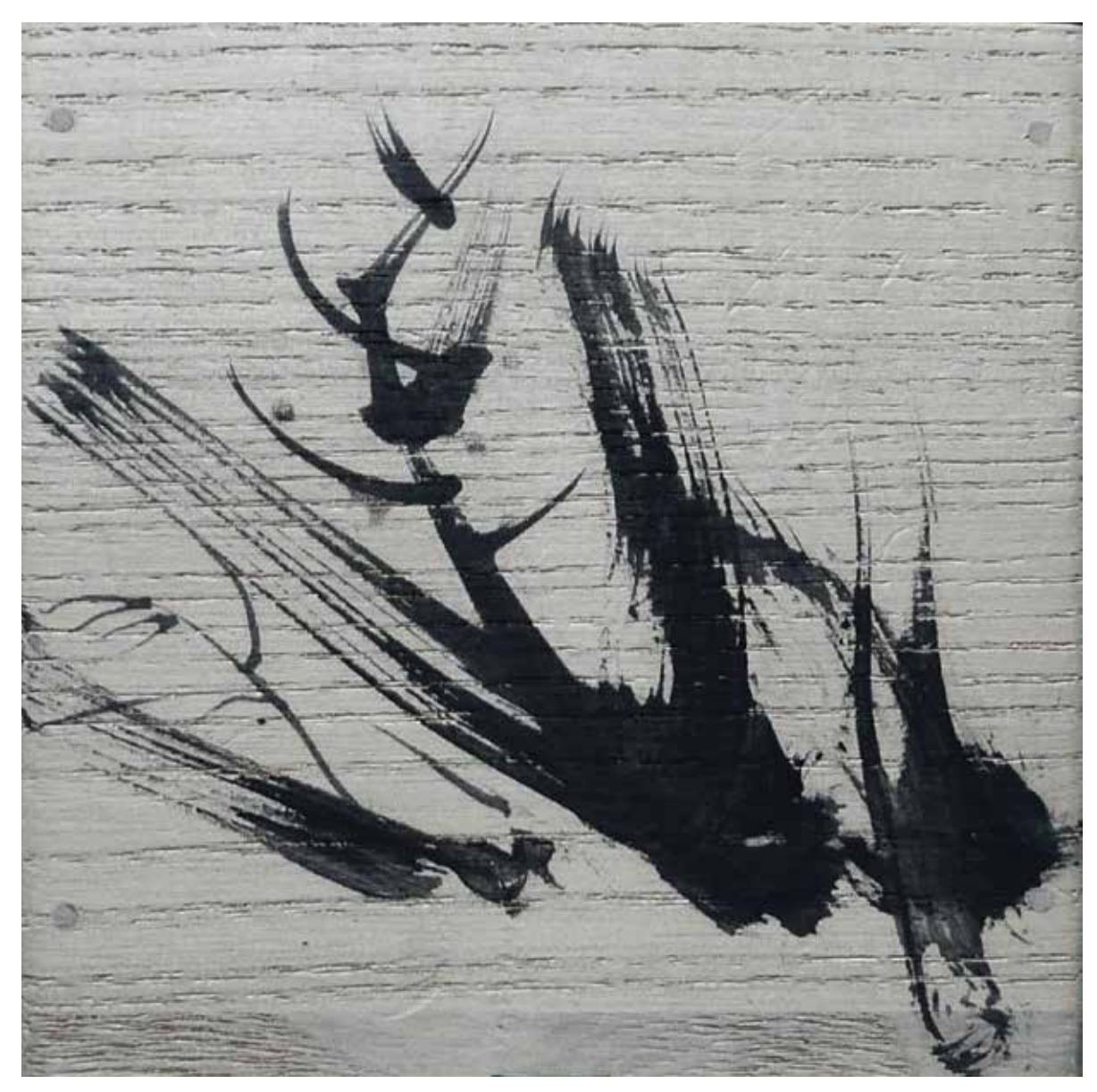
Fig. 3. Ajiki Hiro, ink on wood, tomobako.