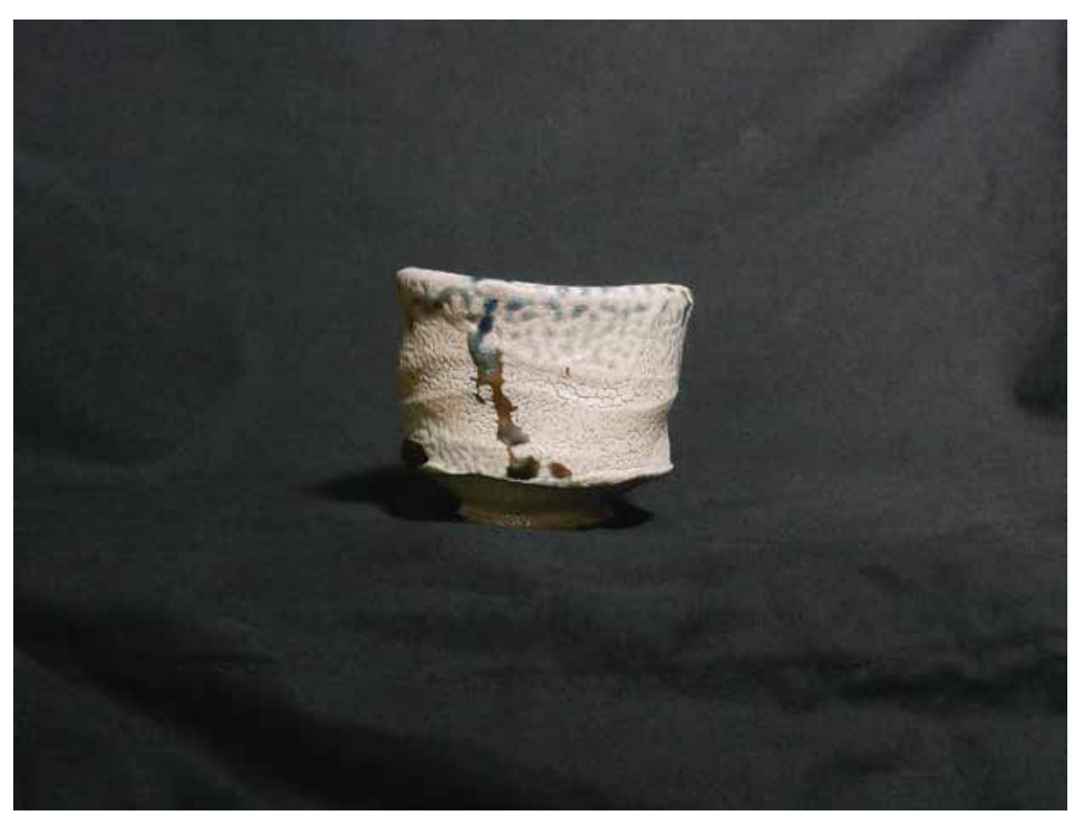
Fig. 2. Ajiki Hiro, Cold Wintry Wind , 2013. Ceramic guinomi, h. 54 mm.