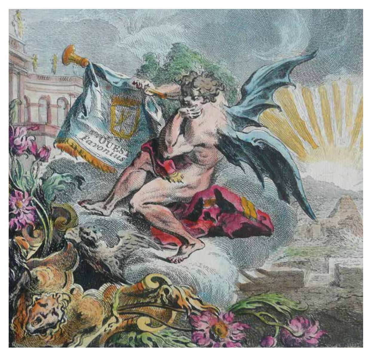
Fig. 1. Anonymous, Favonius (West Wind), colored engraving (n.d.).